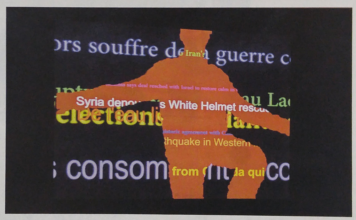
Top: Howie Tsui's Retainers of Anarchy is an animated scroll inspired by Chinese art forms that experiments with visual storytelling. You would have to watch the 25-metre-wide screen for more than an hour to take in all the possible action. Above: Cheryl Pagurek's Connect roughly outlines its viewer's body - by moving around, you control what you see.